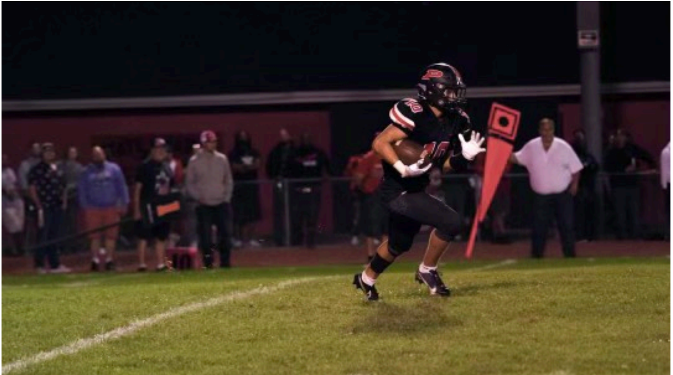
PHS Football